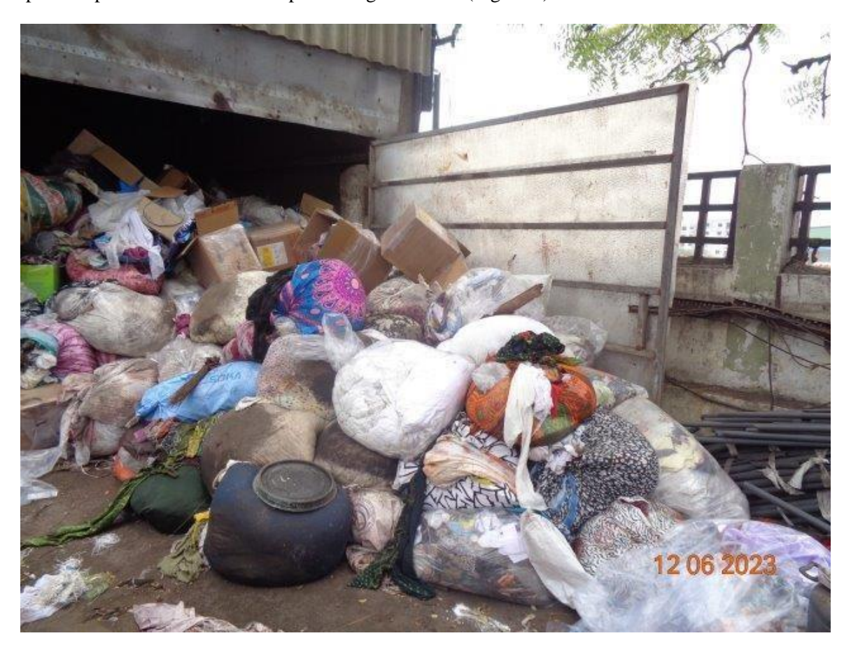
Figure 1. Unsegregated waste dumped in the storage area of textile processing mill.

As indicated in Table 1, Table 2 and Table 3 there are common categories of solid waste generated in all three zones. Excess cloth cutting, fabric waste, and loose fibres produced as a result of rejects from the quality department are the most prominent categories of solid waste generated in textile wet processing. These fabric waste/cloth cuttings are produced in large quantities in the processing departments of the mills and then thrown away (Figure 1). Other primary sources of solid waste generation are combustible fuels. Wet processes like bleaching fabrics, printing and finishing require extreme temperatures up to boiling (100 °C). Some processes, like polyester dyeing and cotton printing, require steam generation. In India, it is observed that coal is the primary choice for fueling boilers used for steam treatments given to fabrics. Coal combustion residues like fly ash, bottom ash, and boiler slag are other major solid waste components produced in textile wet processing industries (Figure 2).