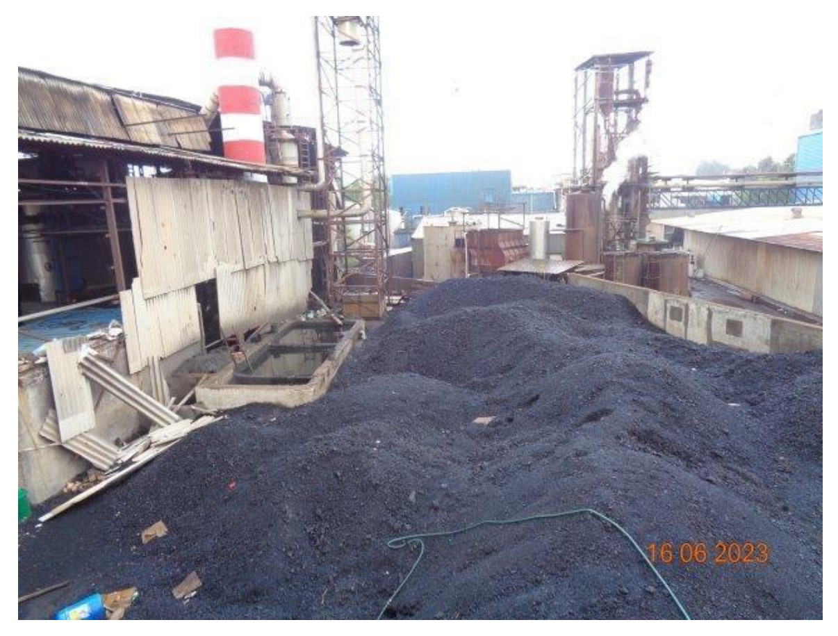
Figure 2. Coal combustion residues not disposed safely.

Plastic waste arises from packed plastic films and incoming raw materials like yarns and greige fabric. Discarded shade cards, dyeing/printing recipe cards, and other stationery contribute to paper waste in the processing units. Waste of machinery spares makes for the metal waste produced in industries. Other solid waste generated in textile industries is from waste tube lights, biomedical waste, empty chemical drums, carboys and waste cartons used in the facility.