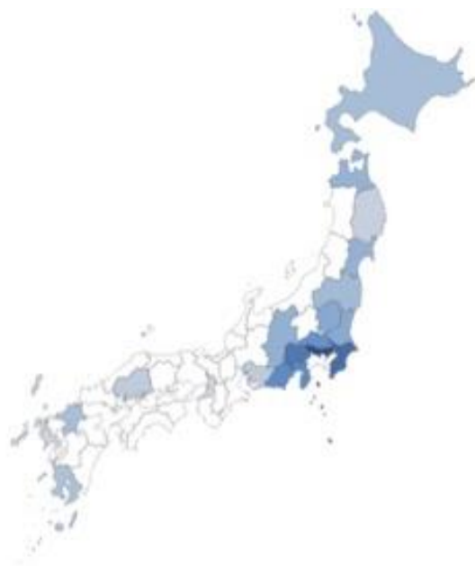
Figure 2. The map of the outmigration population of Kanagawa to major provinces. Made by authors. The darker shade shows a higher level of migration.