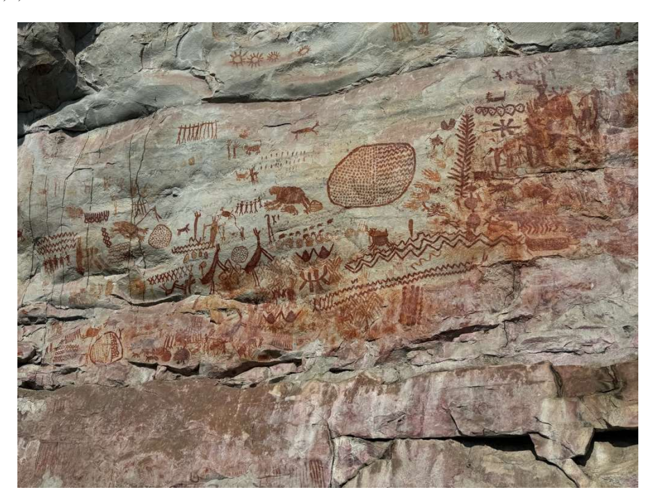
Figure 2. Pleistocene rock art in the Colombian Amazon. Las Dantas panel at Cerro Azul, Sierra de la Lindosa depicting a large mammal interpreted as a now extinct giant sloth. These images suggest early concepts of territoriality, patch selection and the formation of social identities around high-quality resources.