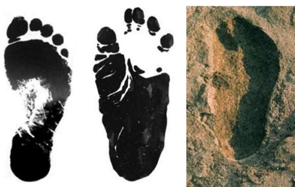
Figure 2. Footprints of (from left to right) Homo sapiens , Gorilla beringei (Eastern gorilla), and of extinct African hominid, possibly Australopithecus afarensis , at Laetoli 3.5–3.7 Ma [149]. Not to relative scale.

Moreover, it has been suggested that Ardipithecus and Orrorin were possibly better bipeds than the later australopithecines [8,32,73], which is not in contradiction with the possibility that these species were intermediate between a more orthograde ancestor and the knuckle-walking extant African apes. In fact, knuckle-walking may have developed in the late australopithecines instead of being initially present in the early australopithecines.